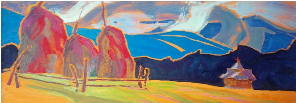
Kryvopilian Trio 2014 oil on canvas 19.5 x 39.3 inches